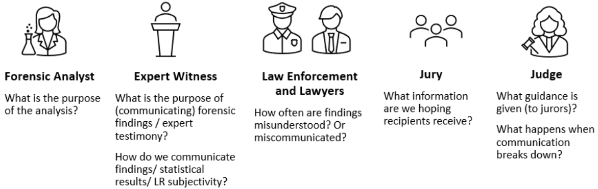
Figure 3: Roles of communicators and recipients (credit: Sanne Aalbers/NIST)

Presentations and discussions were held on the impact different roles and how the mode of communication (written reports or verbal testimony) can impact how information understood and interpreted by different stakeholders (i.e., scientists, law enforcement, lawyers, judge, jury).